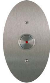
Figure 3: Hall Call

In the event of a building power failure, the system is provided with a temporary power back-up system to allow the elevator to run down to the next available landing, or to the first floor landing. On resuming normal building power, the back-up system will turn OFF and begin automatic recharging.