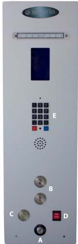
Figure 1: Sample COP