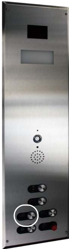
Figure 3 Door Open Button

When the elevator is at a landing level, the Two-Speed Horizontal Sliding Doors or Automatic Pro-Door can be opened by pressing the Door Open button. Normally the doors will have opened and already closed automatically. The Door Open button allows the door to be reopened.