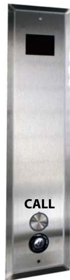
Figure 2 Keyed Hall Call

In the event of a building power failure, the door/gate system is provided with a temporary power back-up system to continue the opening operation for a number of times. On resuming normal building power, the back-up system will turn OFF and begin automatically recharging.