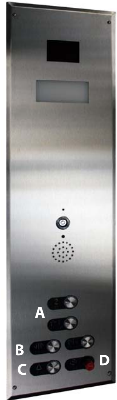
Figure 1 Keyed COP

A single handrail is mounted to the Cab Operating Panel (COP) side of the cab below the COP.