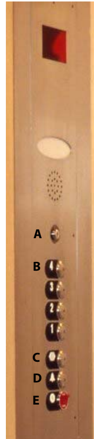
Figure 1: 4 Stop COP

The COP emergency light remains ON in the event of a main power failure. The emergency light uses a Battery Back-Up system with an automatic recharger.