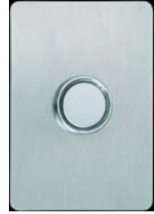
Figure 2: Hall Call

In the event of a building power failure, the door system is provided with a temporary power back-up system to continue the opening operation for a number of times. On resuming normal building power, the back-up system will turn OFF and begin automatic recharging.