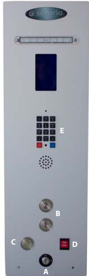
Figure 1: Sample COP

This button can be used at any time to stop the cab and activate the alarm buzzer.