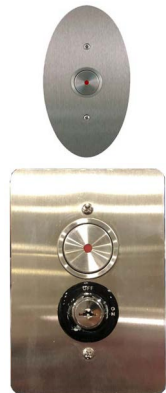
Figure 3: Hall Call

The Landing Door/Gate lock prevents the movement of the cab unless the door/gate is in the closed and locked position. If the door/gate is not completely closed, the cab will not move.