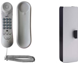
Figure 2: Standard Phone and Phone Box

If the unit has a standard phone, it is located in the cab phone box (see below).