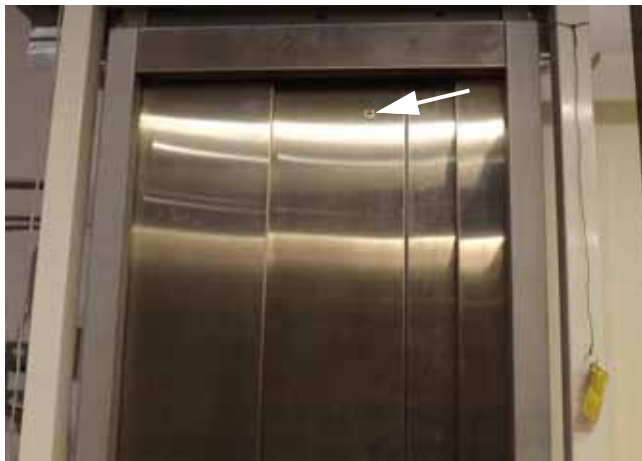
Figure 4: Auto Slim Landing Doors Emergency Opening

When power is turned back on, the elevator will go to the lower landing to relearn the doors.