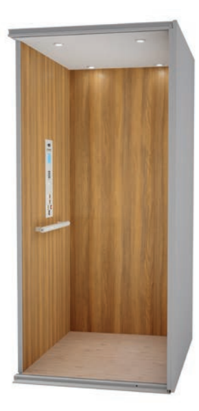
Karuna Ash Melamine