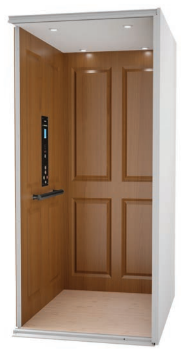
Maple Hardwood – Nutmeg

Standard Melamine walls and optional ceiling