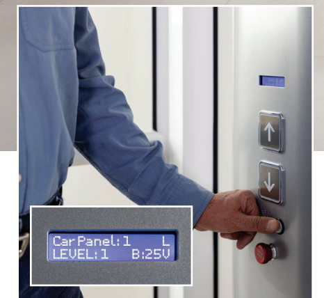
Simple, intuitive operation with in-cabin lift status LCD panel