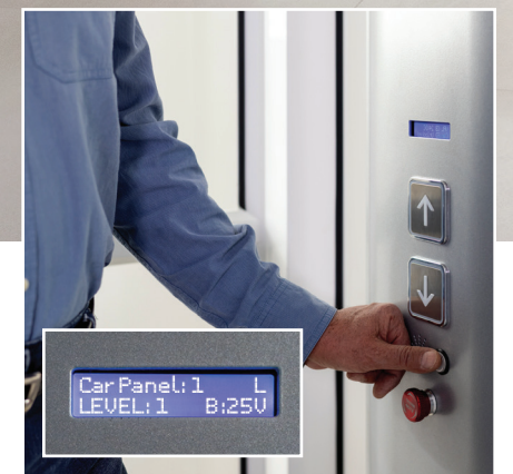
Simple, intuitive operation with in-cabin lift status LCD panel