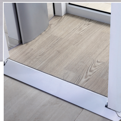
Sloped threshold and attractive non-skid flooring