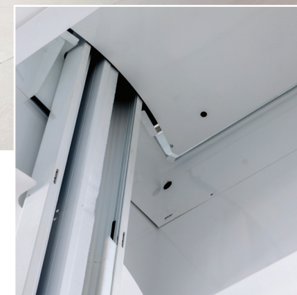
Self-supporting rails with tucked-away cable system