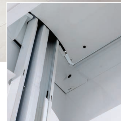
Self-supporting rails with tuck-away cable system