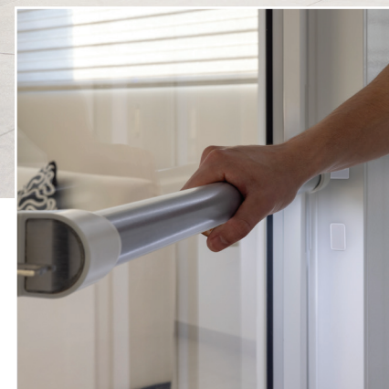
Handrail and full height acrylic panels