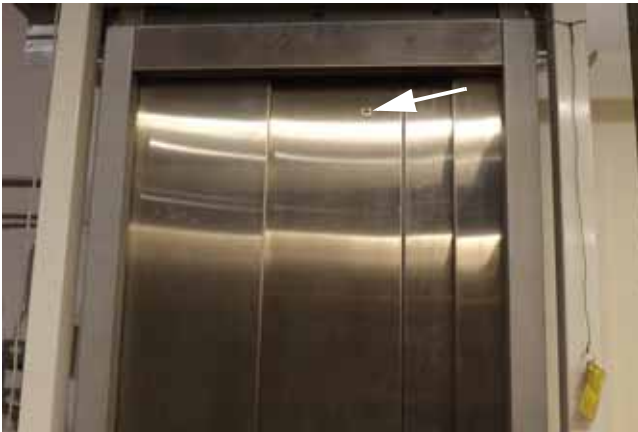
Figure 4: Auto Slim Landing Doors Emergency Opening

When power is turned back on, the elevator will go to the lower landing to relearn the doors.