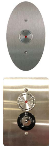
Figure 3: Hall Call

In the event of a building power failure, the door system is provided with a temporary power back-up system to continue the opening operation for a number of times. On resuming normal building power, the back-up system will turn OFF and begin automatic recharging.