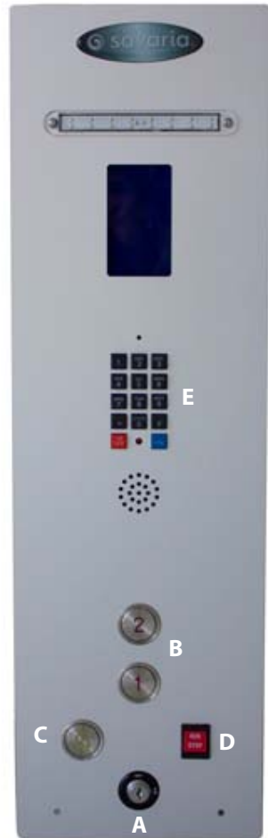
Figure 1: Sample COP

This button can be used at any time to stop the cab and activate the alarm buzzer.