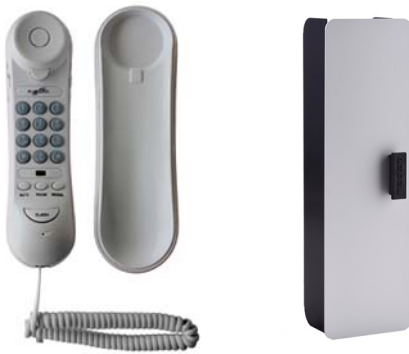
Figure 2: Standard Phone and Phone Box

If the unit has a standard phone, it is located in the cab phone box (see below).