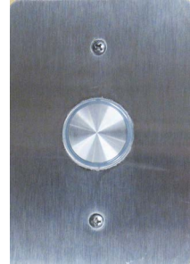
Figure 2: Hall Call

In case of emergency, the door can be opened manually using a special key inserted onto the round pin on the front of the lock (Figure 8).